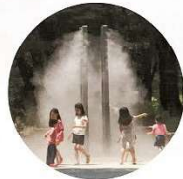
MISTING / COOLING OFF STATION