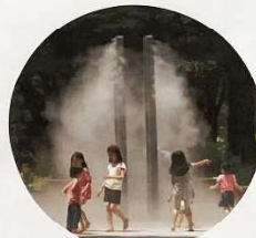
MISTING / COOLING OFF STATION