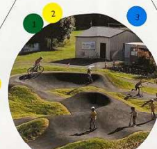
PUMP TRACK (FOR BICYCLES, SKATEBOARDS, ETC.)

Do you have additional ideas? Please write them down on the list below: