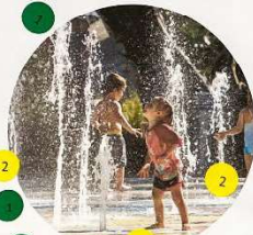
WATER SPRAY DECK / SLIP PAD