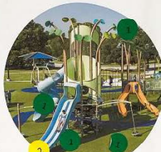
UPDATED LARGE PLAYGROUND