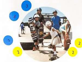
SKATE PARK (FOR SKATEBOARDS)