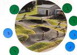
PUMP TRACK (FOR BICYCLES, SKATEBOARDS, ETC.)