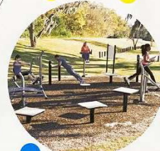
ADULT EXERCISE / FITNESS EQUIPMENT