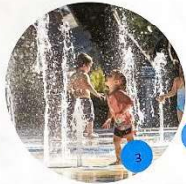
WATER SPRAY DECK / SPLASH PAD