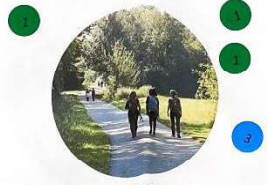
WALKING PATHS / TRAILS