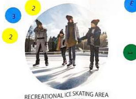
RECREATIONAL ICE SKATING AREA (SMALL RINK)