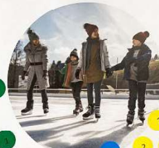
RECREATIONAL ICE SKATING AREA (SMALL RINK)