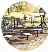
ADULT EXERCISE / FITNESS EQUIPMENT