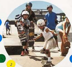
SKATE PARK (FOR SKATEBOARDS)