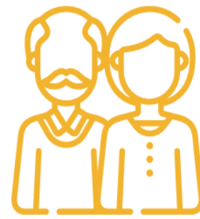
Optimal Wellbeing for Older Adults