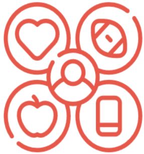
Healthy Eating and Active Living

The Farmington Valley Health District's community health assessment (CHA) and community feedback demonstrated that the following priority areas needed to be addressed in the CHIP :