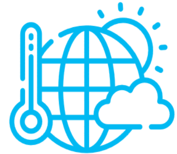
Emerging Environmental Health Concerns

Workgroups for each priority area, consisting of community members and subject matter experts, were formed and met from September 2023 to May 2024 to develop the CHIP .