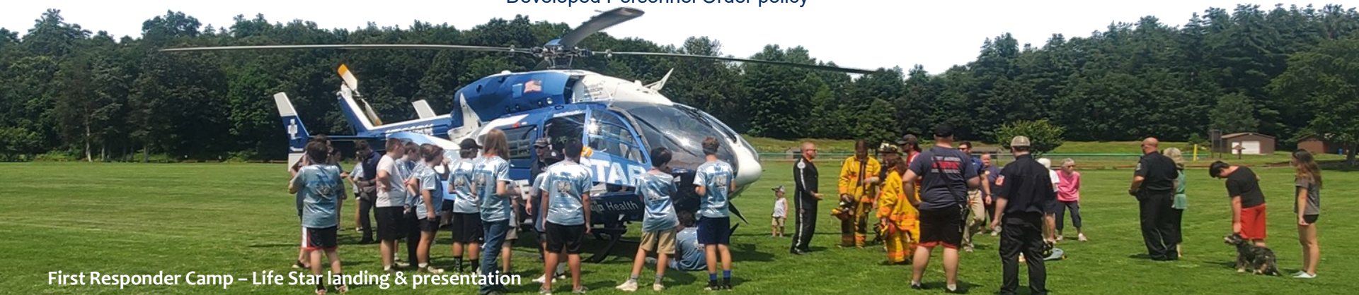
First Responder Camp – Life Star landing & presentation