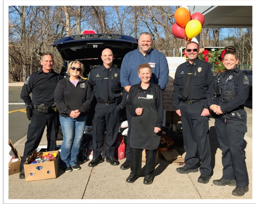
2024 Holiday Food Drive